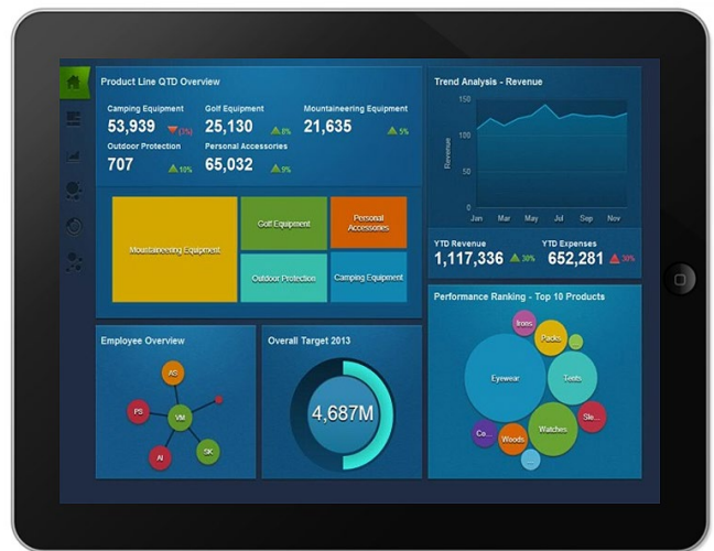
Figure 2: Access highly visual and interactive reports with Cognos Active Report when connected or disconnected.