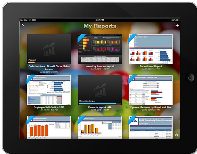
Figure 1: Personalize your Cognos Mobile experience by rearranging content and renaming your workspace.

For example, you can share your perspectives with others on your iPad by highlighting an area for discussion and then sending an email with comments, insights and actions to the appropriate people. Because you can communicate information regardless of where you are, you can take timely action.